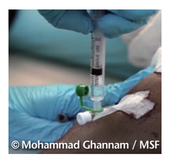
The Turkish Hospital receives 100 patients daily – of those, an average of 40 cases come to the emergency room.