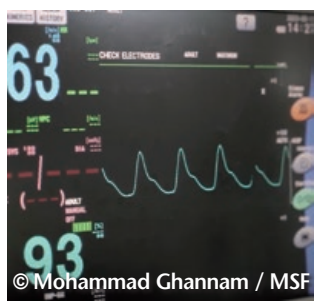
Up to 20% of patients in the emergency room can be war wounded when there is an escalation in the fighting.

The shortage of vaccinations and sanitation facilities puts the children at risk of numerous preventable infectious diseases. Malaria, measles, meningitis, cholera and pneumonia are common illnesses, while medical staff have noted increases in cases of diarrhea and dehydration due to the poor drinking water quality.