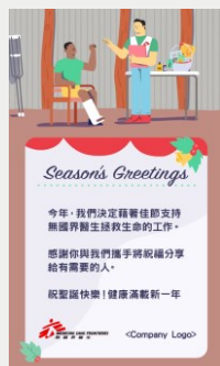
E-card B ( EN / TC )