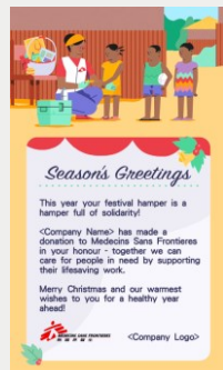
E-card A ( EN / TC )