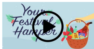
Greeting Video ( EN / TC )

Minimum Donation HK$ 3,800 per design = Ready-to-use therapeutic food (RUTF) for a 4-week treatment to 24 children