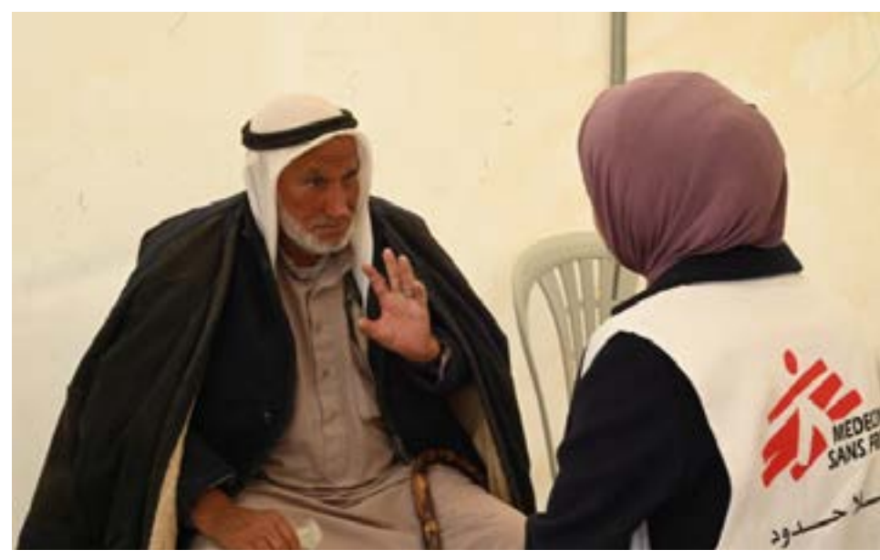
An MSF staff member speaks to a 70-year-old beneficiary from AI -Majaz community in Masafer Yatta, West Bank, Occupied Palestinian Territories

The first month after 7 October was especially violent, which was reflected in the increase in mental health support needed. Up to 149 Palestinians who had experienced violence by Israeli soldiers and/or settlers required psychological first aid from MSF—compared to 78 during the previous month, a 91% increase. As of 7 March 2024, MSF's mental health team in Hebron has provided counselling and psychotherapy sessions to 125 new survivors of violence by Israeli forces and/or settlers since 7 October, including 54 women and 40 children, some as young as three, four, and five years old. An additional 321 Palestinians (including 29 children and 158 women) who were affected by violence by Israeli forces and/or settlers received psychological first aid from MSF. Of those, 292 were affected by violence by the Israeli forces (91%), 10 by Israeli settlers (3%), and 19 by Israeli forces and settlers (6%). The vast majority, 226 patients, exhibited symptoms of anxiety after experiencing a home incursion.