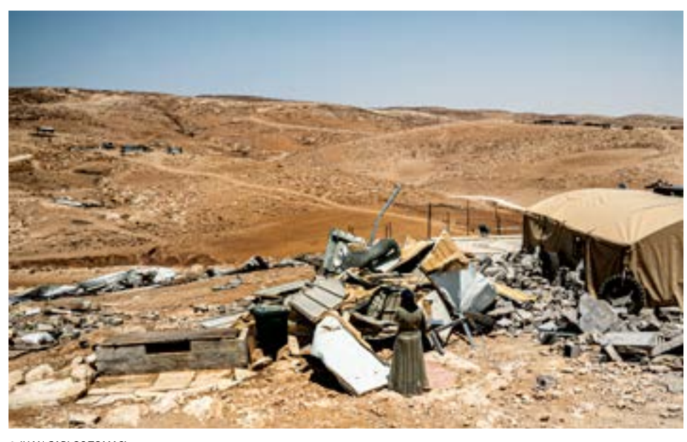
Demolished shelter in Masafer Yatta West Bank, Occupied Palestinian Territories

According to UN Office for the Coordination of Humanitarian Affairs (OCHA), of the injuries recorded across the West Bank since 7 October, 33% of those have been caused by live ammunition, compared with 9% in the first nine months of 2023, indicating a stark shift in tactics.<sup>26</sup> MSF patients in H2 shared stories of soldiers shooting with live ammunition at young men and houses as well. One patient reported, "they aim weapons at us immediately as we open the house door." Another patient shared, "there was a young man crossing the road, so the soldiers attacked him, and when my nephew went to defend him, the soldiers tried to shoot my nephew."